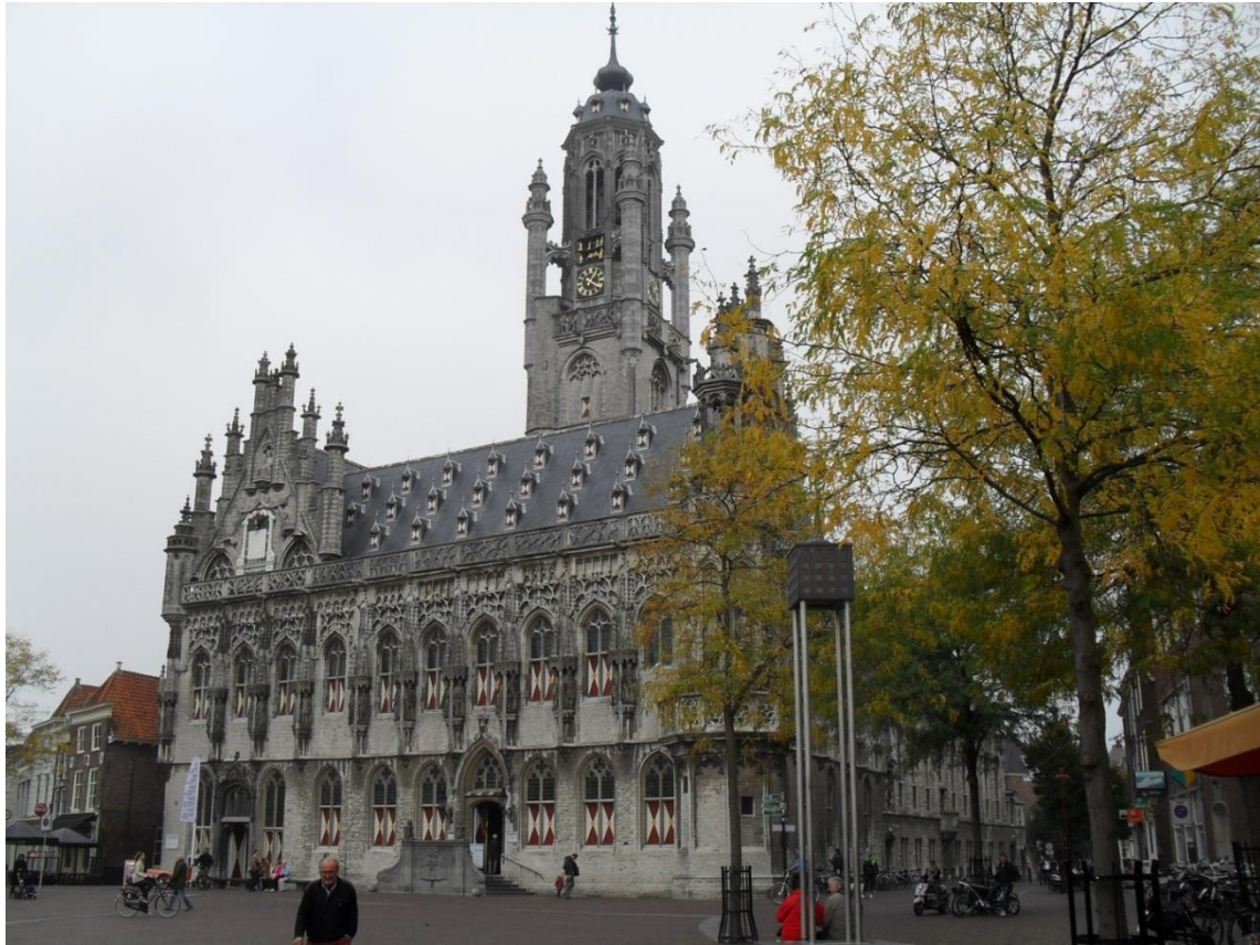
The stunning venue for SI's 2010 conference in Middelburg, The Netherlands